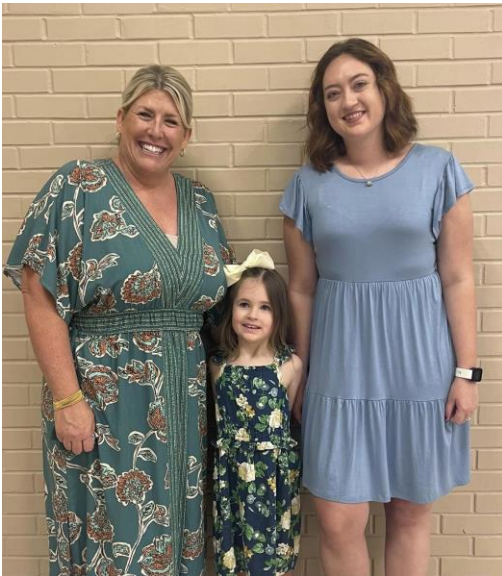
MDO Pre-K Teachers