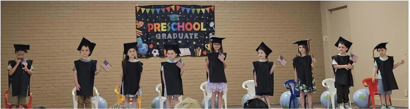
9 – Mother's Day Out - Pre-K Graduates

MDO GRADUATION – was held at Grace Church on May 30 th . The Pre-k class performed songs for their families to enjoy. Once the graduation ceremony concluded, cake & punch was served to everyone. This year our Mother's Day Out had 9 graduates!